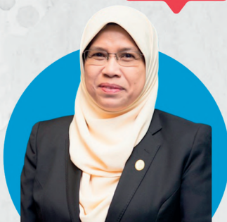
Yang Berhormat Rodziah Ismail