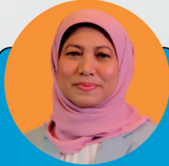
Yang Berhormat Dato' Sri Hajah Nancy Shukri

Minister of Women, Family and Community Development, Malaysia