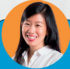
Yang Berhormat Lim Yi Wei

United Nations Population Fund (UNFPA) Malaysia Representative